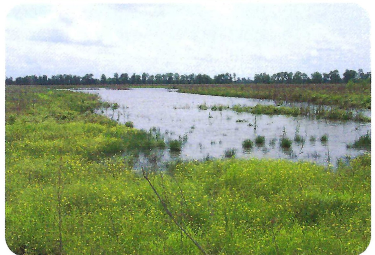
Photos: top to bottom - Mallard close-up by Fyn Kynd Photography, Flickr CC 2.0; Permanent Wetland Reserve Easement in the Mississippi Alluvial Valley (MAV) by NRCS; Wetland reserve easement in the MAV by NRCS

Watch a video to get started: https://www.youtube.com/watch?v=ChB4sp2Bq00